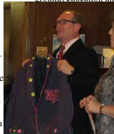
Pastor Appreciation gift – right up his alley!