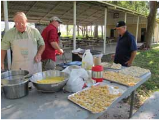
Every church has its "Good Cooks!" Lighthouse is no different!

This was a good weekend, meeting a young pastor and his family, a spirit-filled church, and seeing four lost souls accept the Lord.