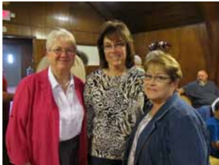
The ladies have provided lap blankets for those who feel a chill. The blankets are placed throughout the church.