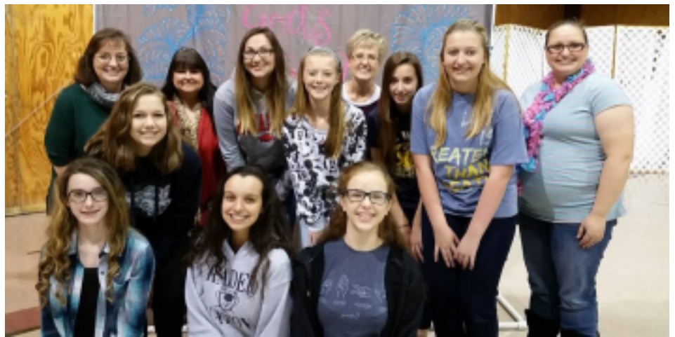
WNAC's Shine Conference helps teen girls understand how to be God's girl in today's culture. Many Texas FWBs joined the 160 who attended in Little Rock last November.

The girls were separated from the adults and were first taught that they are "fearfully and wonderfully made" in the image of God and that they are God's Girls first and foremost. They were shown how to honor their bodies as the temple of God and were given scripture to refer to whenever they have questions. The lessons showed the girls that they are deserving of respect and should expect no less from friends, boyfriends and even strangers. They decorated sunglasses to protect their eyes because their futures are so bright!