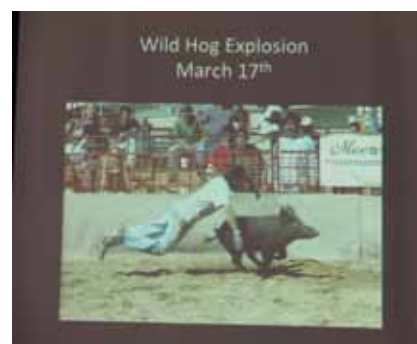
The week following our visit promised to be a fun time for the guys!