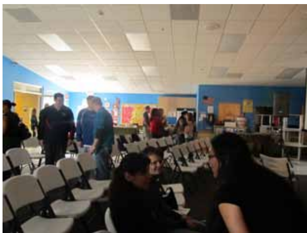
Time to greet one another. Lots of love flowing here!