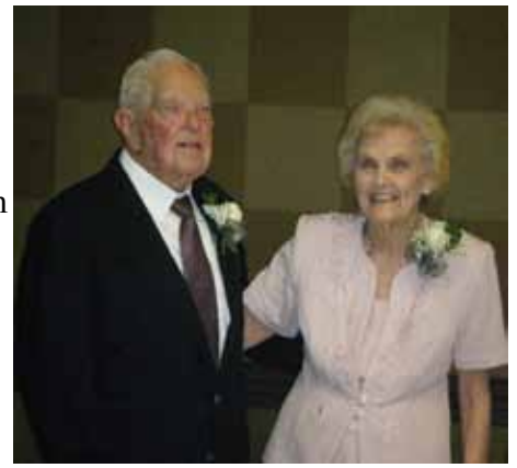
70th Wedding Anniversary!

Howard Payne University had prepared him to teach and he did for 30 years. His preferred church would always be a small one and he would support himself by teaching while preaching. The list of churches over the 46 years has included: Comanche,