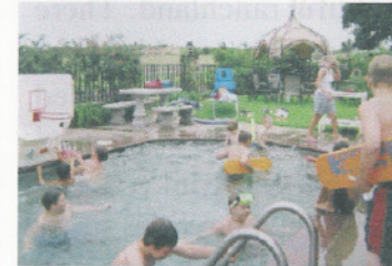
Swimming Cooling off in the summer