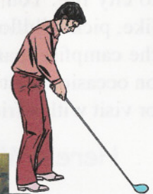
Golf Lessons Another version of Western swing