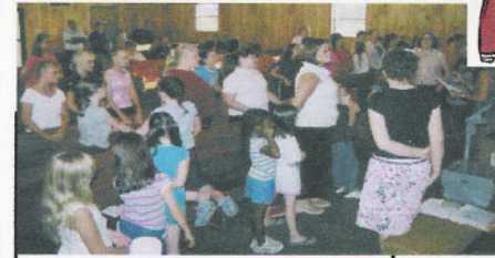
Worship During Chapel and Evening Worship